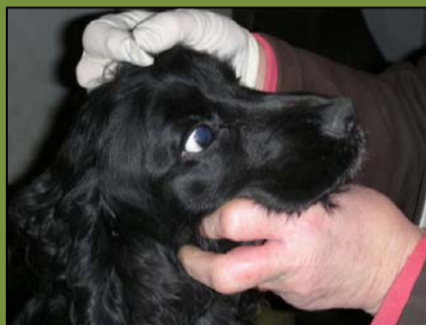
COMB FOR DEAD HAIR

A DOG NEEDS TO BE CLEAN, DRY AND TANGLE FREE BEFORE STARTING TO TRIM. IT IS BEST TO STAND DOG ON A TABLE. REGULAR BRUSHING WITH A SLICKER BRUSH AND COMBING WITH A WIDE TINED COMB REMOVES KNOTS AND DEAD HAIR.