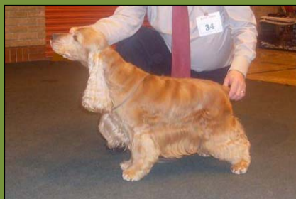
READY TO WIN PRIZES