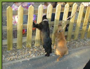
OR TO GO FOR A NICE WALK