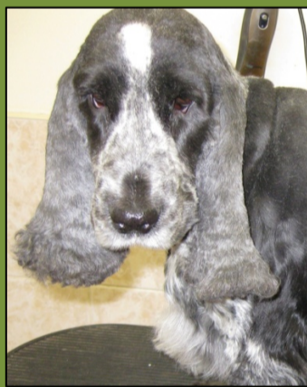
PET CLIPPED EARS