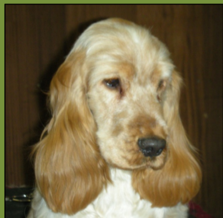
SHOW TRIMMED EARS