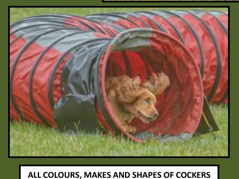
TAKE PART. HERE COMES THE COMPETITION!