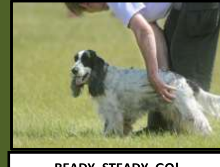
READY, STEADY, GO!